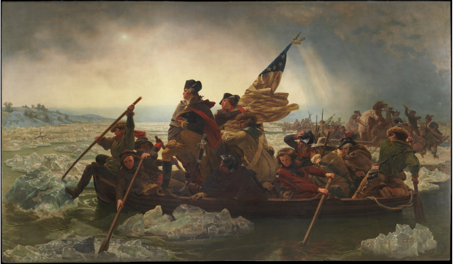
Artist Emanuel Leutze: 1851